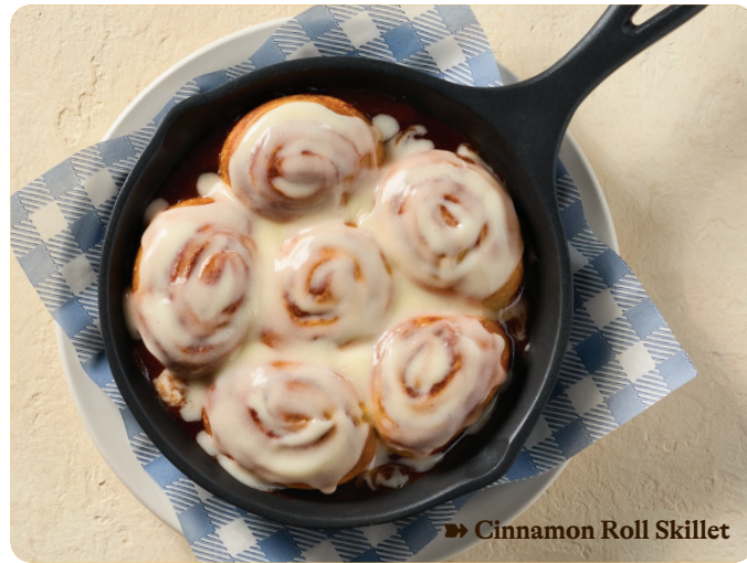
► Cinnamon Roll Skillet

Fluffy fried biscuit dough tossed in cinnamon sugar, then dusted with powdered sugar. Served with a sweet butter pecan sauce (690 cal).