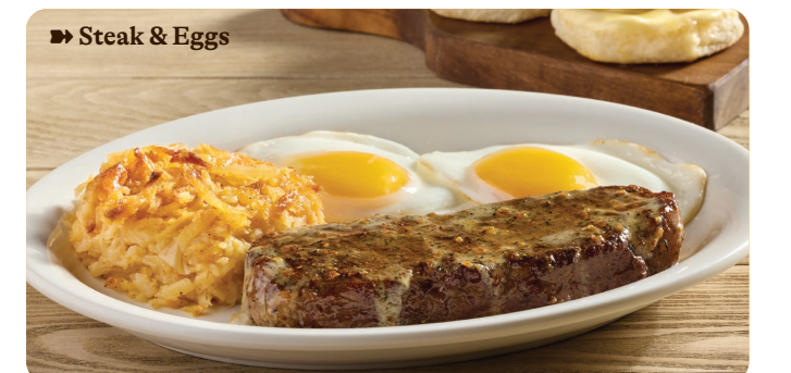
► Steak & Eggs

Crumbled smoked sausage, scrambled eggs, onions, red peppers, green chiles, and Colby cheese layered with a double portion of our signature hashbrown casserole. All served over sawmill gravy and topped with diced tomatoes, green onions, and fried onions. Served with warm buttermilk biscuits. (1380 cal)