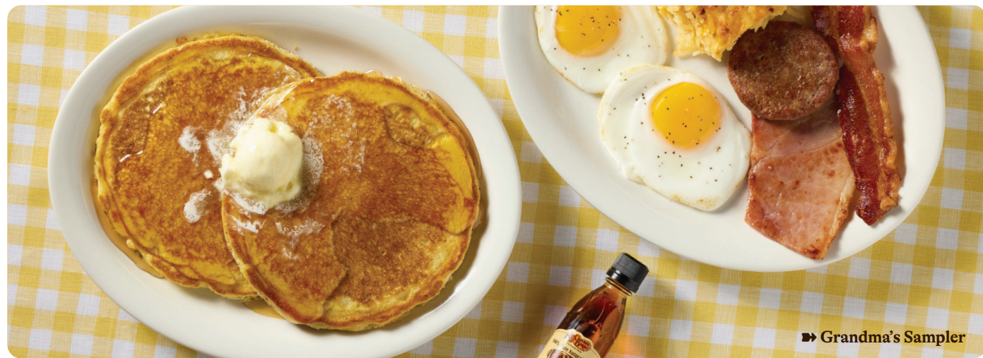
► Grandma's Sampler