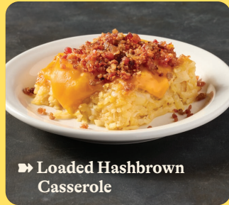
➔ Loaded Hashbrown Casserole